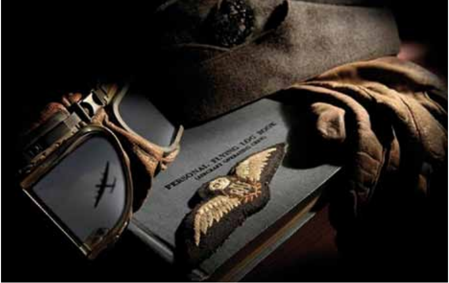
Our Core Values: Respect, Integrity, Service and Excellence

seated belief that the Service's success depended on the training, education and development of its people. In this respect, little has changed: well-motivated and highly quality personnel with the agility to adapt to a constantly changing operational environment remain at the core of the RAF's effectiveness; the core values of respect, integrity, service and excellence provide the cornerstones of our capability.