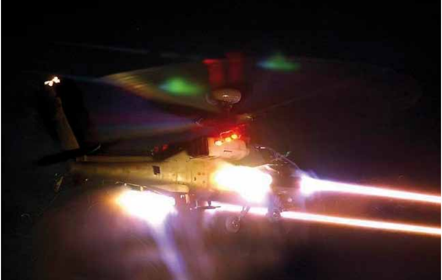
Complementary capabilities: an Army Air Corps Apache provides firepower support at night

enemy land forces represents an attractive option, not least because it minimises the risk of casualties to friendly forces in a traditional, surface force-on-force engagement.