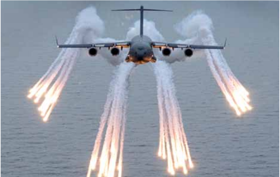
Global reach: A C-17A Globemaster III dispenses flares