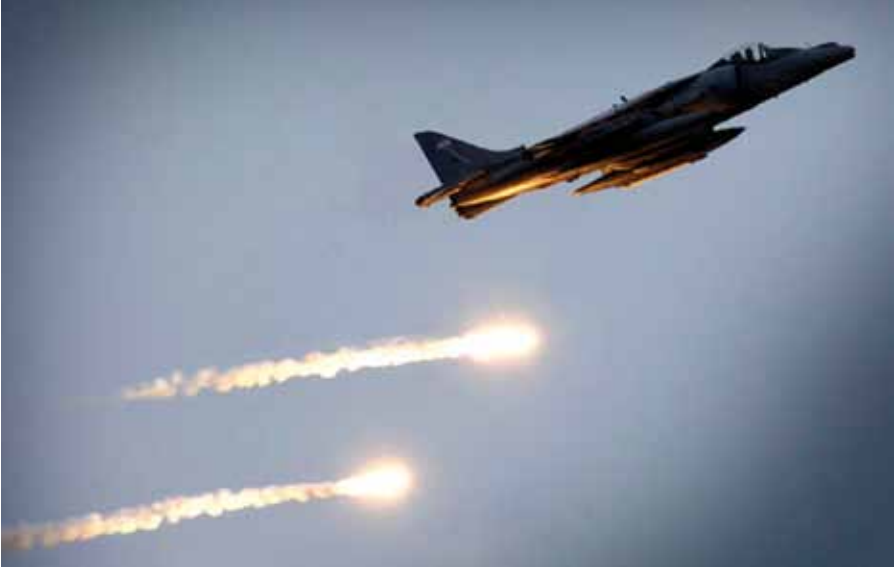
Non-Kinetic Attack: A Harrier GR9 Conducts a 'Show of Force'