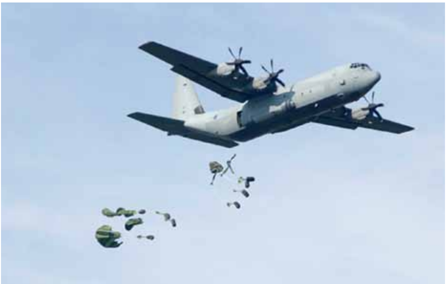
Precision air drop: a C-130J Hercules air-drop in Afghanistan

Between May and December 2007, RAF C-130J Hercules in Afghanistan conducted low altitude night missions to re-supply forward operating bases using an air-dropped container delivery system. Nearly 1,000 containers were dropped, containing 800 tons of food, water, ammunition, fuel, generators and even power-plants for CVR (T) fighting vehicles.