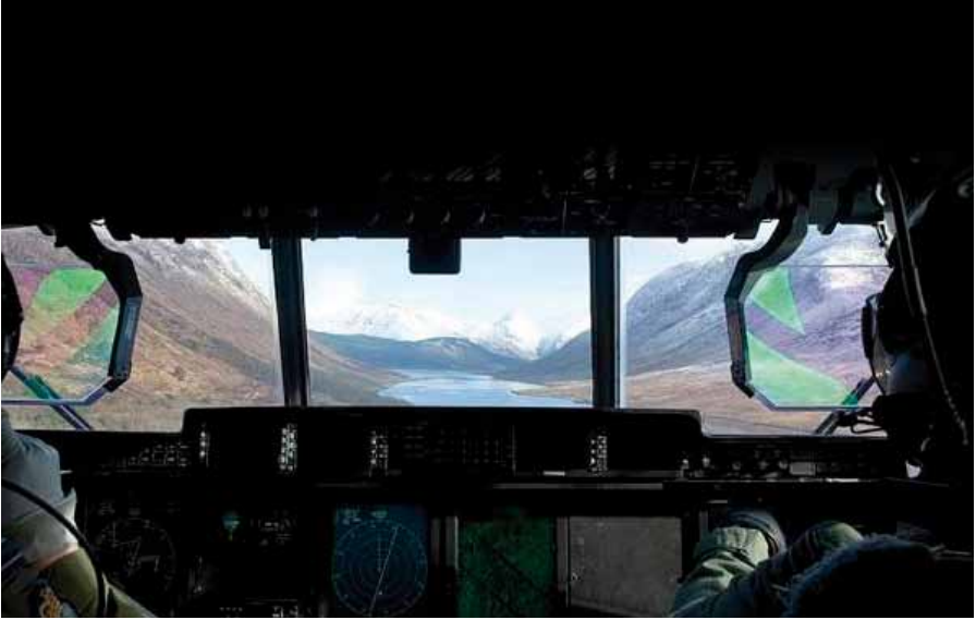
The Airman's Perspective: the flight deck of a C-130J Hercules on operations