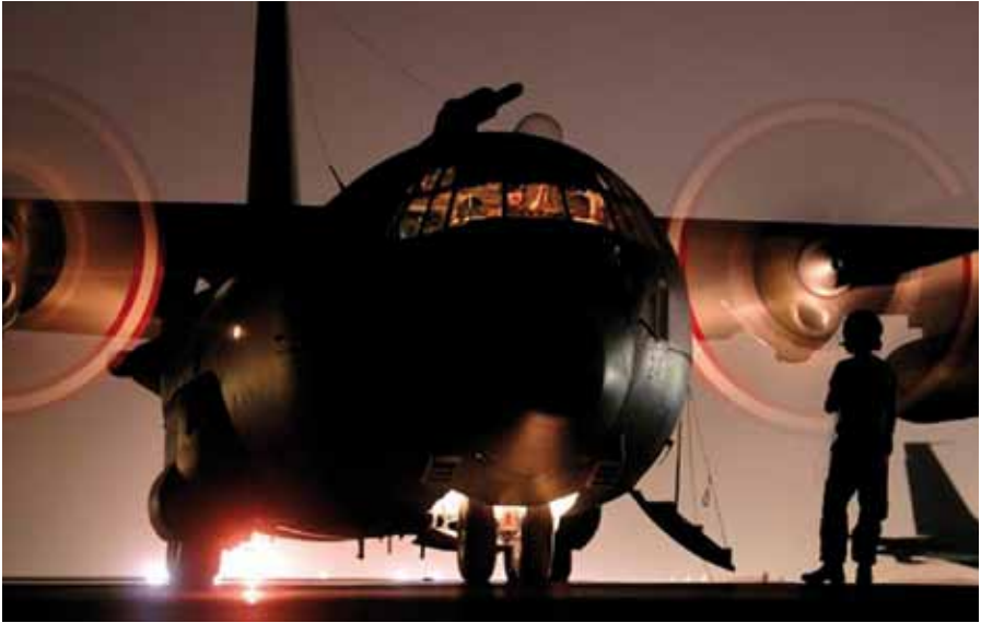
Fixed-Wing air lift: a C-130K Hercules begins a mission in the Gulf

In June 2007, the crew of a Merlin HC3 extracted a seriously wounded soldier from Basra at night under sustained small arms fire. It was assessed that the soldier would have died within fifteen minutes without the rapid insertion of the Immediate Response Team.