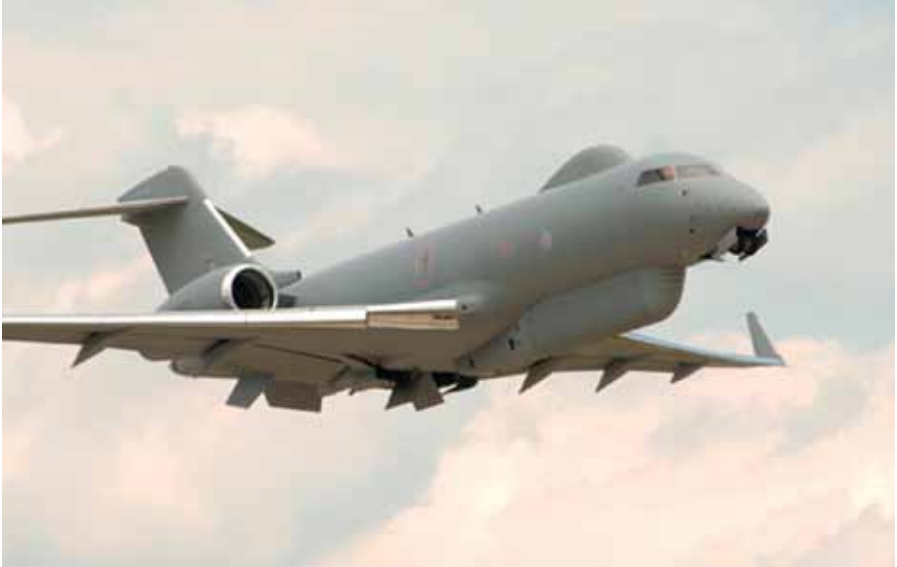
Surveillance and Reconnaissance: a Sentinel R1 of No V(AC) Sqn