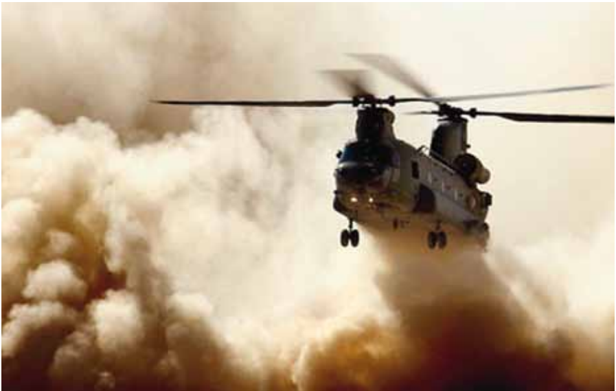
The Lynch pins of Tactical Mobility: a Chinook HC2 arrives at a Tactical Landing Zone during Operation HERRICK in Afghanistan

AE is a specialised form of air lift for transporting ill or injured personnel under medical supervision to appropriate medical treatment facilities.