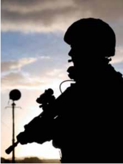
Air-Minded Force Protection: RAF Regiment in Afghanistan