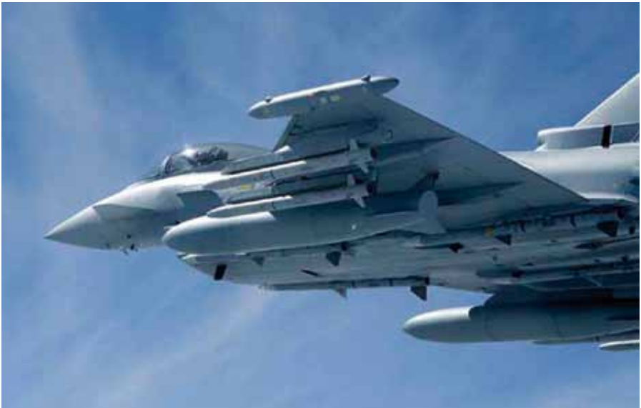
Control of the Air: the Typhoon