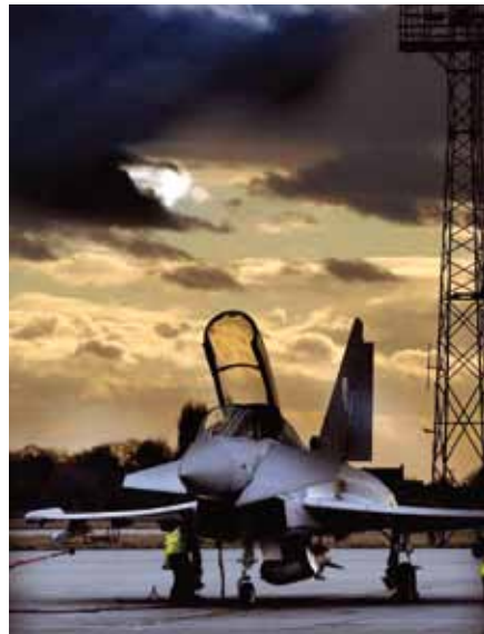
A Typhoon F3 is prepared for flight at RAF Coningsby

Air power's fundamental attributes make precise definitions problematic. It can be difficult to specify exactly what a unit of air power is, or even what it can do, and this has sometimes led to misconceptions about its utility. In the future, advances in technology and the restructuring of organisations and processes are likely to blur the boundaries between the air and space environments, so that the concept of aerospace power will better express a pervasive and seamless military use of the third dimension. Until that point is reached, space power is best regarded as being separate, but complementary to air power, sharing many of its attributes, but in a distinct way, and at a very different scale.