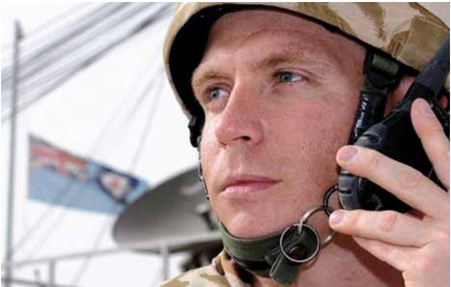
Adaptive Air Command on operations

However, the process is surprisingly flexible if it is properly understood and joint planning has been conducted from the outset, so that windows of opportunity for responsive air power have been built into the Air Tasking Order (ATO). In practice, the placing of high-calibre and qualified liaison officers in reciprocal headquarters has proved to be the key to ensuring that the right degree of flexibility is delivered.