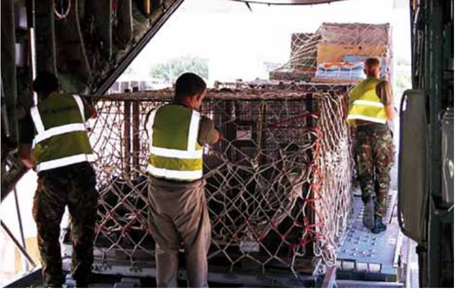
Deployed Air Logistics: RAF Air Movements personnel unload a C-130 Hercules transport aircraft

logistics principles and procedures laid down in UK Joint, Air and Multinational logistic publications. 7 As an integral element of the Joint Supply Chain, Air Logistics is governed by the same generic guiding principles, 8 but is also subject to the additional and distinct air-logistics principles of responsiveness , attainability , sustainability and survivability .